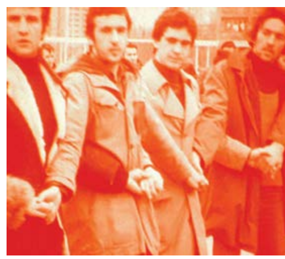
2013, 12', Blu-Ray, experimental

AFC "Students city" Cultural centre, Serbia Directed by Salise Hughes Contact afc-program@dksg.rs