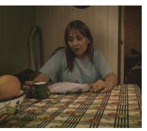
2013, 23', Blu-Ray, fiction

A woman finds a bag full of groceries on the street. She puts the bag in her car and then, disheartened by problems in her life, forgets about it. She drives around with the bag in her car for two days. Finally, after taking out the bag along with the groceries in it, she finds a wad of cash wrapped in paper.