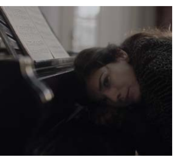
2013, 15', Blu-Ray, fiction

In any country during any war, completely isolated, Mother and Daughter are struggling to survive extreme living conditions having the piano on which they play continuously as their sole companion and only shield from the brutal reality they live in which will eventually force them to sacrifice it.