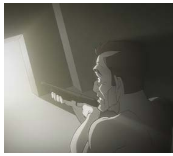
2013, 11', Blu-Ray, animation